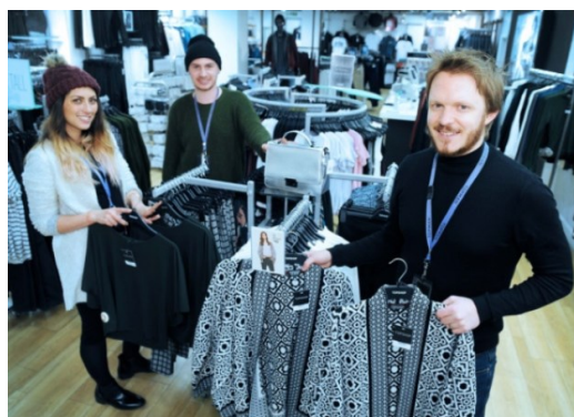
Retail staff who are asked to wear the company's own clothes can not claim a tax deduction for those clothes.

If you're unsure about the tax deductibility of your work related clothing, we invite you to contact us to discuss the rules and regulations.